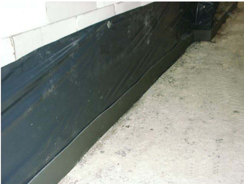
Protection foil on the wall and polifoam band at the edges of the slab